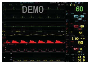
▲ Upto 8 Waveforms