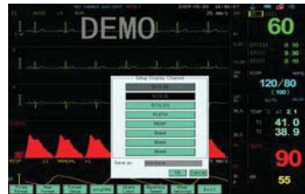
▲ Waveforms setup