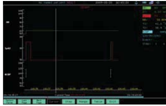
▲ Trend Memory