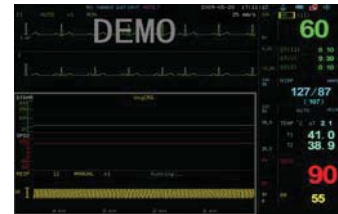
▲ oxyCRG Display