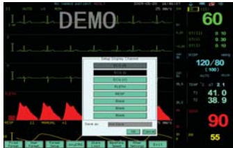
▲ Waveforms setup