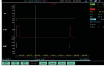
▲ Trend Memory