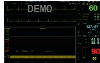
▲ oxyCRG Display